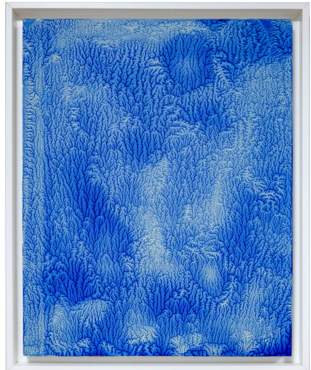
Left: Cyrielle Gulacsy, LD 01, Diffusion de la lumière solaire à travers l'atmosphère terrestre , 2020, acrylic ink on paper, 112 x 77 cm